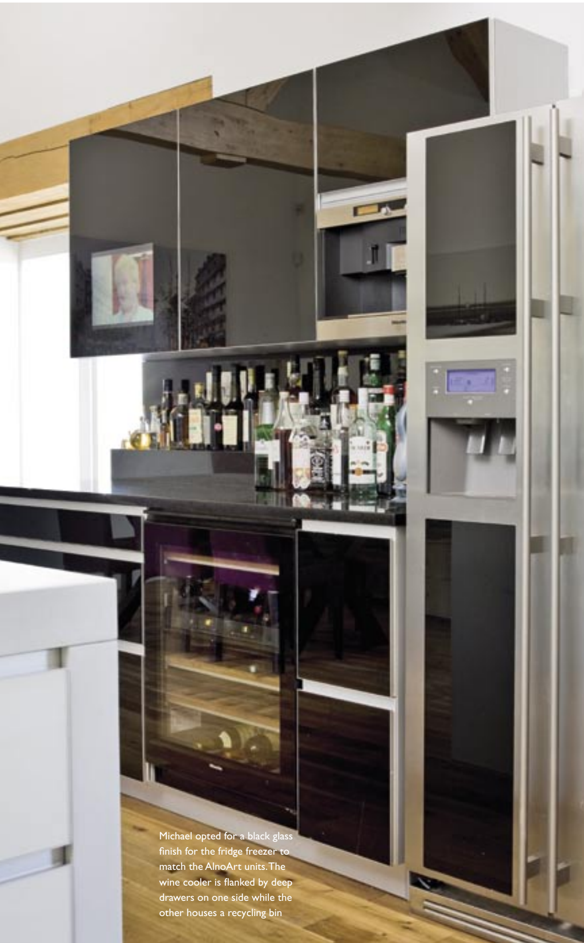
Michael opted for a black glass finish for the fridge freezer to match the AlnoArt units. The wine cooler is flanked by deep drawers on one side while the other houses a recycling bin

MY FAVOURITE DESIGN FEATURE: 'I have the crockery, cutlery, drinks, wine cooler and coffee machine all together in one area. This section has a real restaurant feel and is all about servicing the dining table'